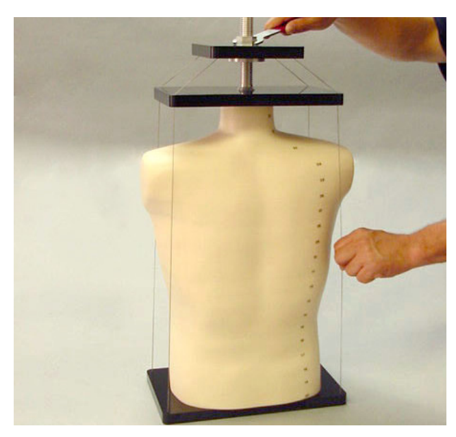
Fully Assembled Model 600